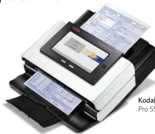
Kodak Scan Station Pro 550