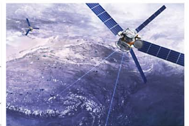
Aerospace & Satellite Imaging

All SmartLF scanners are available in three affordable specification levels: monochrome, color and express color, (m, c, e). m and c models can be easily upgraded via unique email process if requirements change.