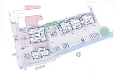
CAD and Technical Drawings

Colortrac has the longest experience of manufacturing CCD-based wide format color scanners. The SmartLF Gx+ 56 scanners offer a combination of long-life, maintenance free bi-directional LEDs with power saving ENERGY STAR® compliance and high productivity scanning speeds. The 6th generation SmartLF Gx+ CCD scanner ranges define a new industry benchmark for high fidelity color, monochrome tone reproduction and image sharpness.